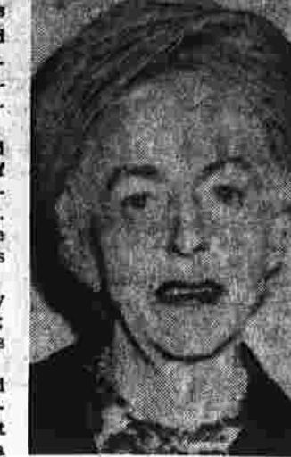
MRS. ELEANOR McADOO

MONTECITO, Calif. (AP) — President Woodrow Wilson's daughter Eleanor suggested that he name William Gibbs McAdoo as secretary of the Treasury "because he was so attractive." "Father had already decided to appoint him for reasons of ability," she recalled later, adding that he had influenced his choice. Mrs. McAdoo died Thursday at her home here. She was 77, the last survivor of Wilson's three daughters. Funeral services will be held at 10 a.m. Saturday at Montecito Community Covenant Church, with interment at Santa Barbara Cemetery. Mrs. McAdoo, who chronicled her father's public and private life in a number of books and short stories, had been active in California Democratic party affairs until 1960. She had been confined to bed for the last 18 months from the White House during Wilson's first term in 1914. Wilson later married the elected U.S. senator from Calif. — former Edith Galt, but the couple was divorced 20 years later when McAdoo was 29. The eldest daughter, Margaret, died in 1914. Wilson later married the elected U.S. senator from Calif. — former Edith Galt, but the couple was divorced 20 years later when McAdoo was 29. The eldest daughter, Margaret, died in 1914.