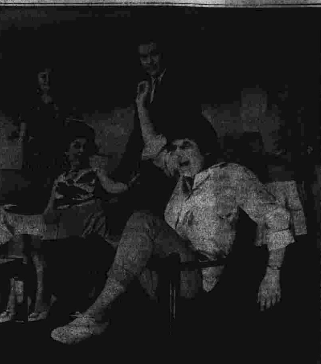
'Ready When You Are, C.B.' at Whiton Hall