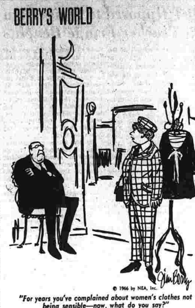
"For years you've complained about women's clothes not being sensible—now, what do you say?"